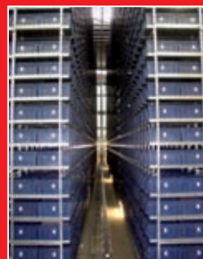
Durch das neue febi Logistikzentrum ist der schnelle Versand von Ersatzteilen garantiert. The new febi logistics centre ensures the quick shipment of spare parts.