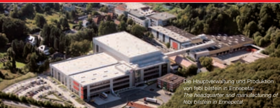
Die Hauptverwaltung und Produktion von febi bilstein in Ennepetal. The headquarter and manufacturing of febi bilstein in Ennepetal.